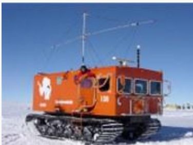
8J1RF/Mobile going 420 km outside the Dome Fuji Base

It looks like DX bulletins seems to keep DX news as a kind of reserved information, to spread out such as something fallen from heaven. Well, up here all is free and lots in advance.